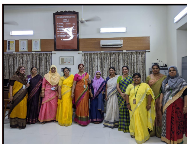
Members of the IQAC